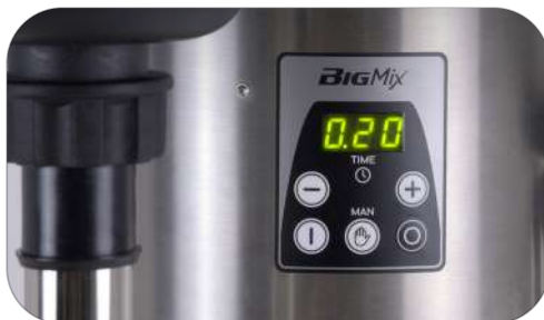
Intuitive operator control panel