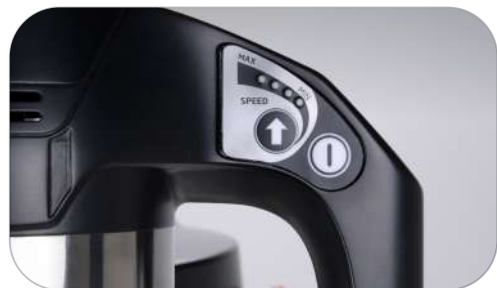
Precise variable speed adjustment