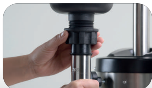
Quick tool coupling